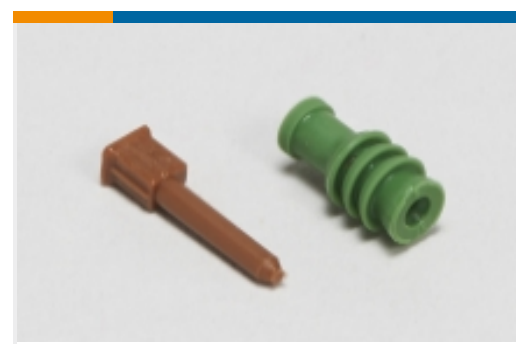
Automotive Seals &amp; Cavity Plugs(5)