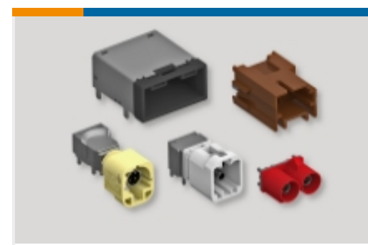
Data Connectivity Headers(2)